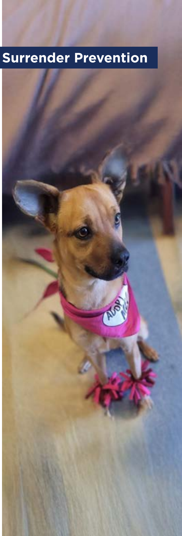
FRANKIE Pet of the Week July 21, 2024