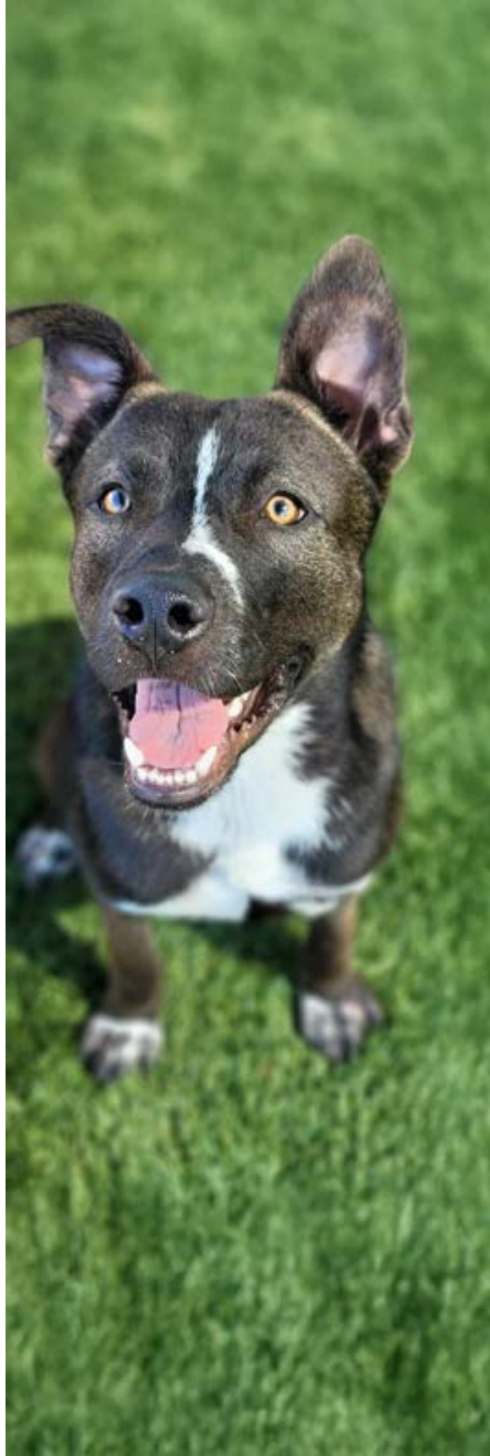
Yoshi FLEAS Special Project

The Friends of the Little Elm Animal Shelter is a non-profit organization that strives to help the animal shelter pets in Little Elm, Texas. The organization provides assistance through volunteering and donations.